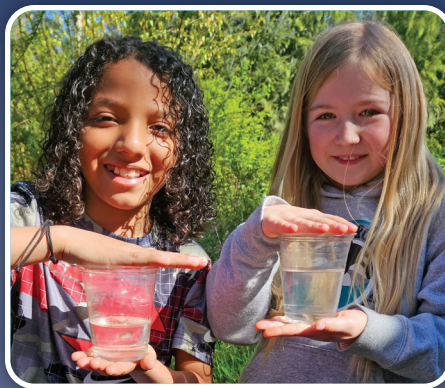
Students release young salmon in Hansen Creek