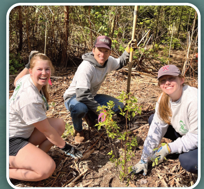
Volunteers plant trees for Earth Day

Restoring riparian areas along waterbodies is a key strategy for salmon restoration in the Skagit watershed. In 2025, Skagit Fisheries partnered with private and public landowners to plant more than 31,000 native plants. Community members, students, staff, interns, and Washington Conservation Corps members made this massive number of trees planted possible. Most projects took place along Skagit River sloughs, known to be important habitat for Chinook salmon. Additionally, one of the smaller streams where planting took place was Little Carey's Creek in Hamilton. Here a straightened stream channel was re-meandered through a forested area to improve salmon habitat and connectivity to a large wetland complex. These native plantings strengthen the entire ecosystem by creating wildlife habitat and filtering pollutants, helping keep local waterways clean and healthy.