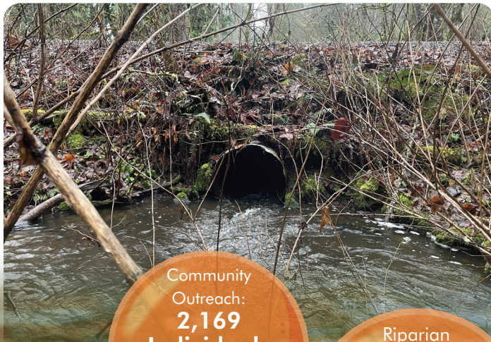
New bridge on Carpenter Creek opens 2.5 miles of habitat for salmon.