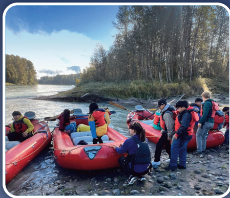
River Journey students explore the Upper Skagit

Our staff and interns also worked with 1,441 students across 14 elementary schools through our Salmon in Schools program, guiding them as they cared for and released young coho salmon into nearby streams. This up-close experience fosters curiosity, environmental awareness, and a lasting sense of stewardship. Together, these programs help young people see themselves as part of the future of salmon recovery and of this community. These education programs faced significant funding challenges this year and your support ensured students continued access to meaningful environmental education. With your help, we can continue inspiring the next generation of conservation leaders.