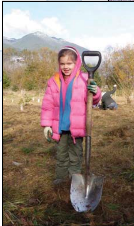
Youngest volunteer of the day at Marblemount Boat Launch