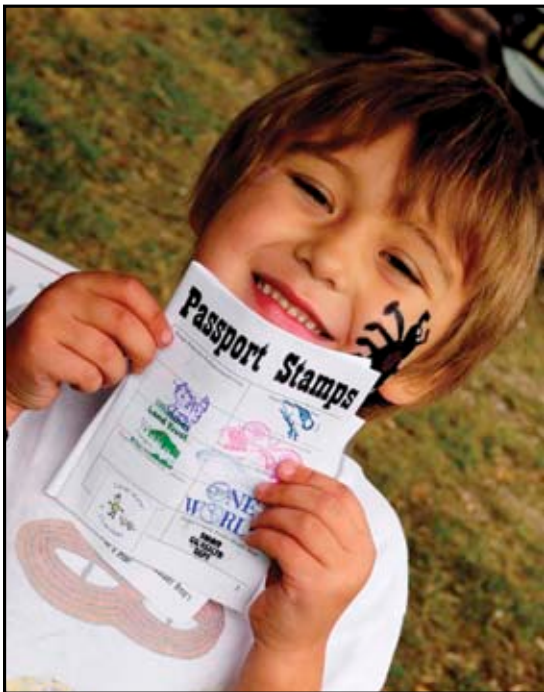
Educational Passport to the Samish almost complete