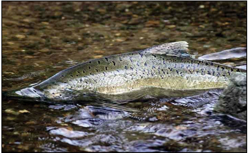
Samish River Chinook by Drew Flesham

Native (of Skagit River origin) Spring, Summer and Fall Chinook stocks occur in the Skagit River Watershed. The Spring run fish enter the river from April through June and migrate to the upper regions of the Cascade, Sauk and Suiattle Rivers containing large pools where these adults reside prior to spawning a few months later. All Pacific salmon stop feeding upon entering fresh water. Consequently, Spring (early run) Chinook depend for months on their stored energy reserves for completing reproductive maturation and maintaining basic metabolism. Summer run fish enter the river in June through July and spawn in August and early September in the upper mainstem and lower Sauk. Fall (late run) Chinook enter the river in late August through September and spawn in the major tributaries (e.g. Hansen, Jones, Finney) of the lower Skagit. These three Chinook stocks are managed for natural production. However, there has been some supplementation over the years from the Marblemount Hatchery. Historically, the Skagit River watershed has produced over 50% of the Puget Sound Chinook