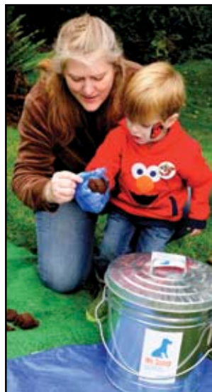
Near Right: Visitors of all ages played The Poop Toss Game to learn how to properly dispose of pet waste (don't worry—it's not real!)