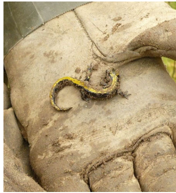
Long Toed Salamander