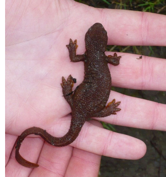
Rough Skinned Newt