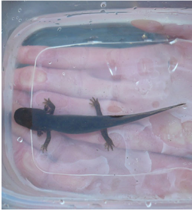
Larval Pacific Giant Salamander

Lately we've been finding lots of amphibians at restoration sites. Among those we've encountered are a rough skinned newt and a long toed salamander (with yellow stripes) at Howard Miller Steelhead Park, and a juvenile Giant Pacific salamander at Finney Creek (in the aquatic phase). Amphibians are a good indicator of healthy habitat, so these little guys are a welcome sight!