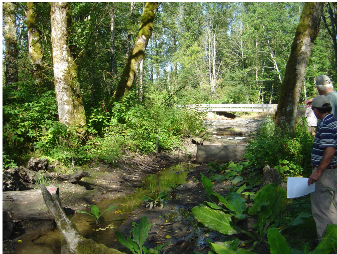
The newly installed bridge at Ennis Creek

The results were impressive; last fall, while coho returns have been crashing elsewhere, approximately 1,000 coho spawners were counted in the creek and late this summer several board members toured the project. What they saw was a truly amazing conversion of a roadside ditch transformed into a beautiful, naturally-appearing creek full of coho fingerlings. It was, without a doubt, a very heart-warming moment! Check it out if you are ever up that way.