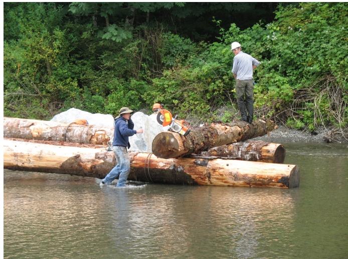
SFEG field crew secure logs to boulders as part of the Finney logjam project.

Less than 20 years ago, natural resource agencies (including the Forest Service) were cleaning logs out of stream systems as a common practice to improve conditions for salmon. Today's research has shown that logs create valuable habitat for salmon, and are a major physical feature of rivers and streams that help control water temperature, and regulate flow conditions and sediment movement. With the listing of Chinook salmon on the Endangered Species list, the Finney Creek log jam projects illustrate a unique partnership between a federal agency, timber companies and a local community group to promote the recovery of threatened salmon species.