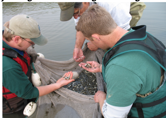
SFEG staff document juvenile salmon and other life in Dry Slough.

Recent accomplishments include placement of 27 log jams on lower Finney Creek to moderate temperatures, and removal of an abandoned road on a Nature Conservancy property to address a fish passage barrier. SFEG also rescued thousands of stranded coho salmon at Red Cabin Creek for the Department of Transportation while they design a new bridge crossing. We sampled salmonids at the mouth of Dry Slough for the Skagit Conservation District. We have also cleared many acres of blackberries and conducted additional mowing and riparian site maintenance on US Forest Service properties. We removed 2,000 feet of old fence on Seattle City Light Property as part of a Natural Resource Conservation Service Wetland Reserve Program project on Anderson Creek. We are also helping Skagit County to implement a CREP project on Hansen Creek.