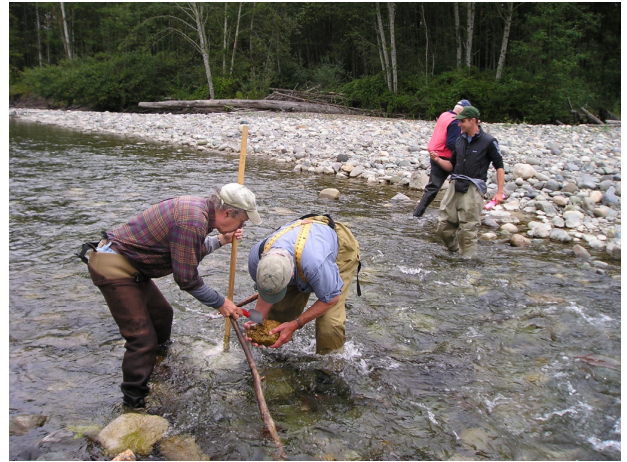
Volunteers collect samples of aquatic macroinvertebrates to help monitor water quality in lower Finney Creek.

Everyone who knows Finney Creek loves the area for its superb recreational opportunities. Certain recreational practices can be harmful to salmon. Driving an ATV or truck through the creek or through a gravel bar can crush salmon eggs and introduce excessive sediment into the clear water that salmon need to survive. Building dams can disrupt the migration of juvenile and spawning salmon. Please keep these things in mind and help us protect the remaining salmon populations struggling to survive in Finney Creek.