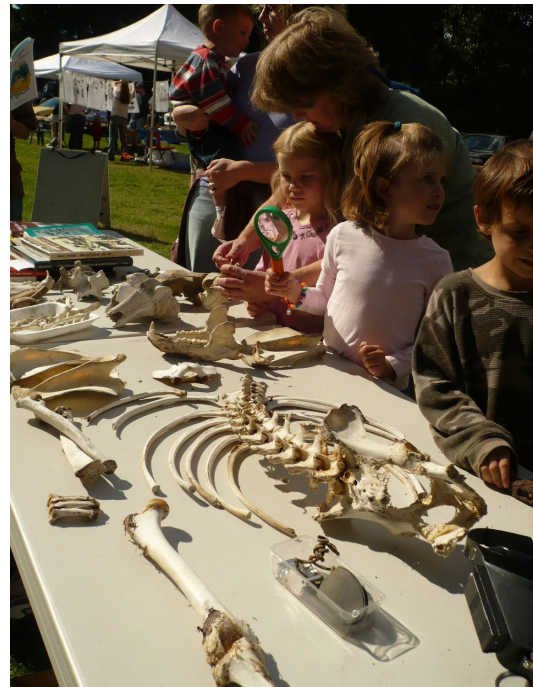
Participants of all ages learned about people and animals of the past and present at an archeology station at the Skagit River Family Fest on September 6th

The Letterboxes are a pilot project, similar to geocaching. In partnership with Skagit Conservation Education Alliance, several organizations have hidden boxes containing information and stamps in different areas near the Skagit River. SFEG has created and maintained two of these boxes. Look on our website ( www.skagitfisheries.org ) for more information about our two letterboxes, and the other ten. It's an educational scavenger hunt for all ages!